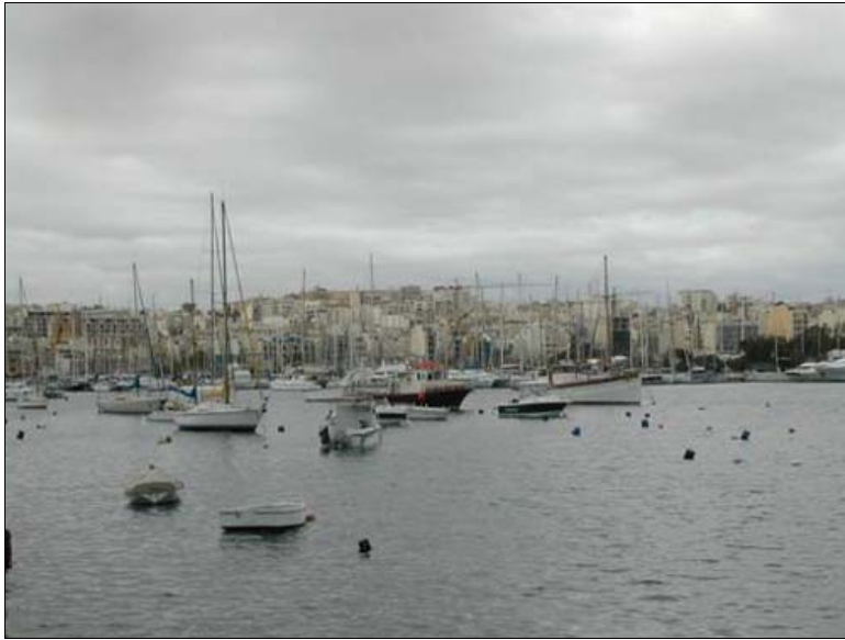
Valletta Harbour, Malta

since conditions have allowed this to be run. Perhaps we are not thinking big enough as I see that the first ever sailing race around the continent of Africa is now being planned!! It commences on 24th July 2011 from La Valletta, Malta and is scheduled to finish at the same point on 25th May, 2012. It will pass around 40 different countries and calls into 23 ports over 16 legs. I believe that the direct distance is about 17,000 miles, so you'll need a bit more kit than for Caldey! There is a fleet of ten Dufour 44 Performance sailing yachts for those entrants who do not want to use their own boat (maybe a Hurley 18 is not quite the part!) so SSC members here is your challenge for next year!