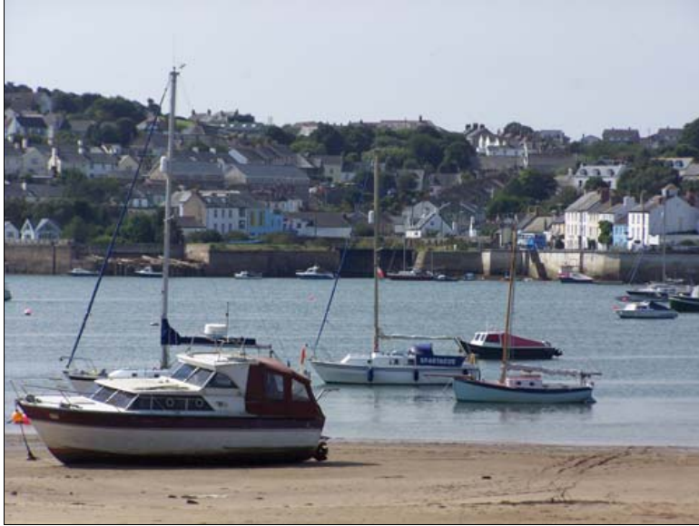
Cruiser Spartacus in Bideford harbour.

Ray and Dot Smith in their cruiser Spartacus picked a superb period last week to cruise over to the North Devon coast calling into Ilfracombe and Bideford. Their trip was enriched by a pod of dolphins who frolicked around the boat during the voyage – a wonderful sight.