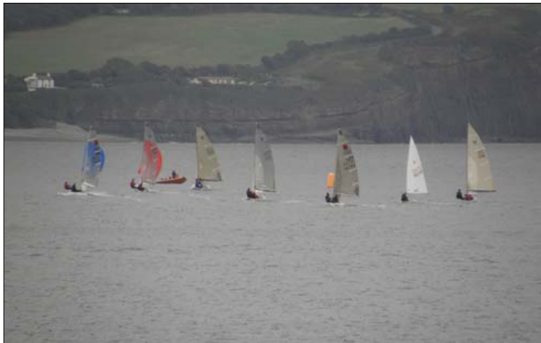
A Fine Reach Regatta Saturday.

Some stimulating sailing was enjoyed over the Regatta weekend although it was unfortunately restricted to the more experienced and competent sailors because the wind strengths were generally force 4 with considerable gusts in the strong 5's. We were however really fortunate with the weather in other respects as the sun shone most of the time which always adds to the "sparkle" of racing or observing! We were pleased to welcome competitors from Tenby and farther afield. Thank you for coming and participating.