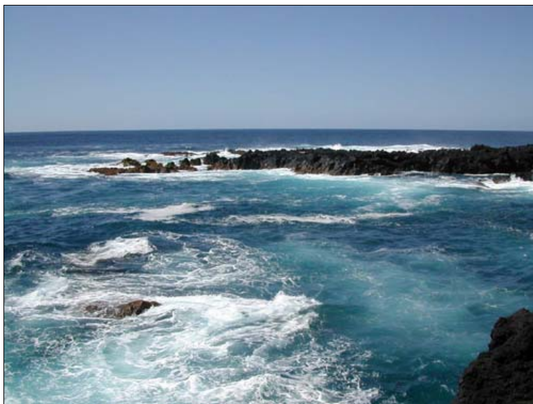
Coastline in the Azores - just look at that sky!

Portugal is often remembered as Britain's oldest ally but we do have another reason to be thankful to that Country, as the Azores (Portuguese) are a large semi-permanent centre of high atmospheric pressure which is the usual source of good summer weather in the UK. The Azores consist of nine islands strung out across some 350 miles of the central Atlantic in the so-called "Horse latitudes". The origins of this name are somewhat bizarre being sometimes attributed to the historical common practice to pay crewmen in advance for their first month's work which was often spent before even boarding the ship, so that for the first month on board, they were difficult to motivate – hence the expression flogging a dead horse. After approximately one month, ships out of the British Isles reached the Horse Latitudes. An alternative origin is from when the Spanish transported horses by ship to their colonies in the West Indies. Ships often became becalmed in this latitude, thus severely prolonging the voyage; the resulting water shortages made it impossible for the crew to keep the horses alive, and they would throw the dead animals overboard.