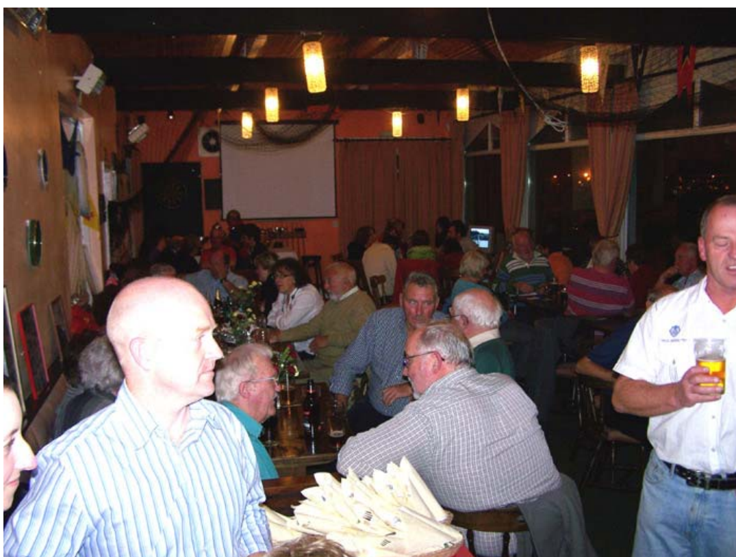
2010 Laying Up Supper.