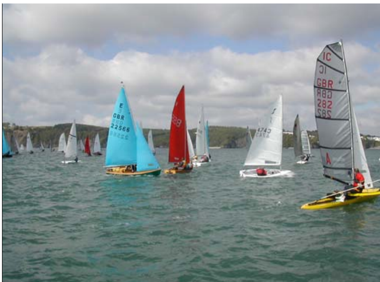
Coppet Week - some fierce competition