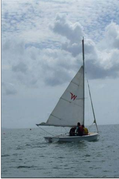
Wayfarer reefed for sail training last Saturday.