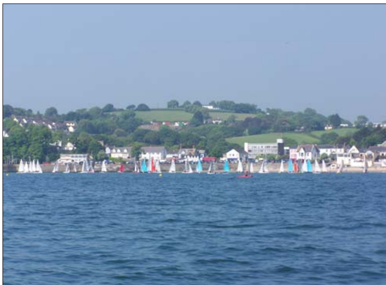
Coppet Fleet assembling from Saundersfoot Beach

Prize giving on the Friday night was of course heaving, especially as the top places were too close to call, raising the excitement for the final results which were not released until the evening.