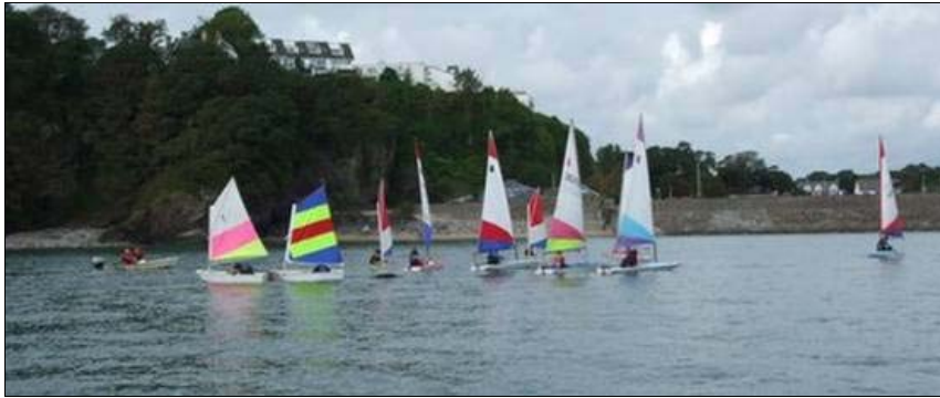
Sail Trainees adding colour to the bay. (Apologies for the photo quality)