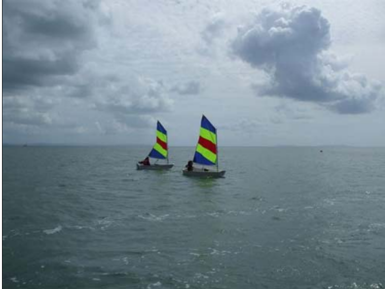
A Brace of Oppies watching the clouds go by.