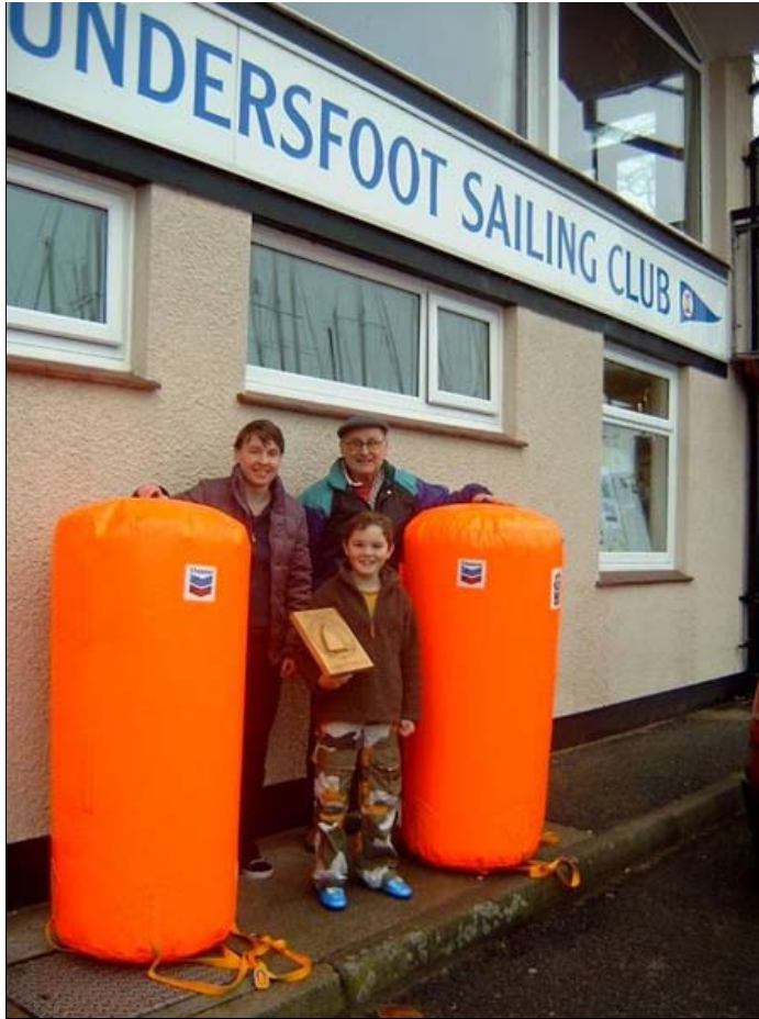
Chevron Buoys & Girl!