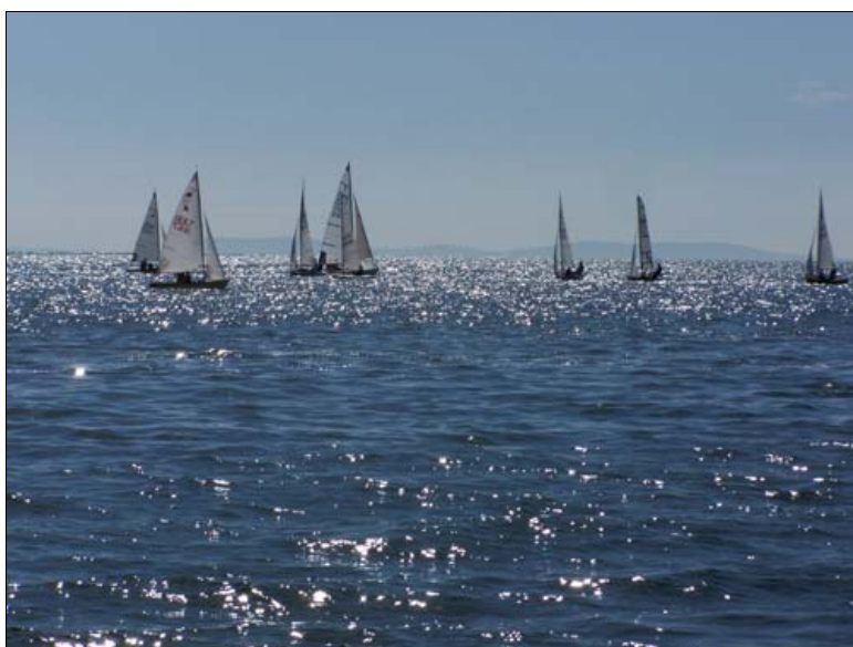
A study of light and water.