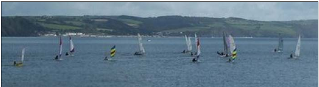
Club race last Sunday. (Apologies for the photo quality)