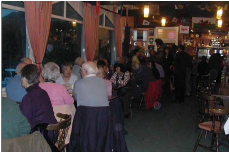
Fitting Out Supper.